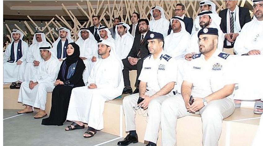
ADSSSA launched the first journey under the TAMM initiative.

Also, we have found that one of the most successful drivers for TAMM is the power of designing the customer's experience and integrating the most innovative technologies. In line with this, TAMM is focused on turning the service delivery model into a journey-focused approach that takes full use of digital technology in the provision of government services. We have set a target to reach a 90 percent customer satisfaction rate, be listed as one of the top ten countries in ease of doing business, and be one of the top five governments in the United Nations' online service index.