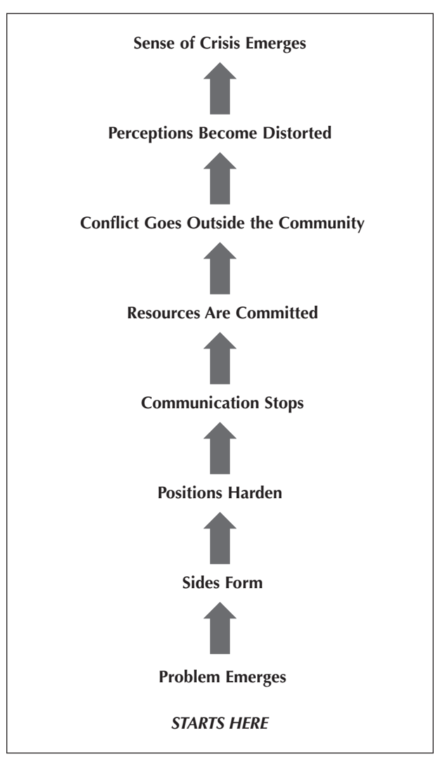
Figure 2: The Spiral of Unmanaged Conflict

Source: Adapted from Carpenter and Kennedy, 1988.