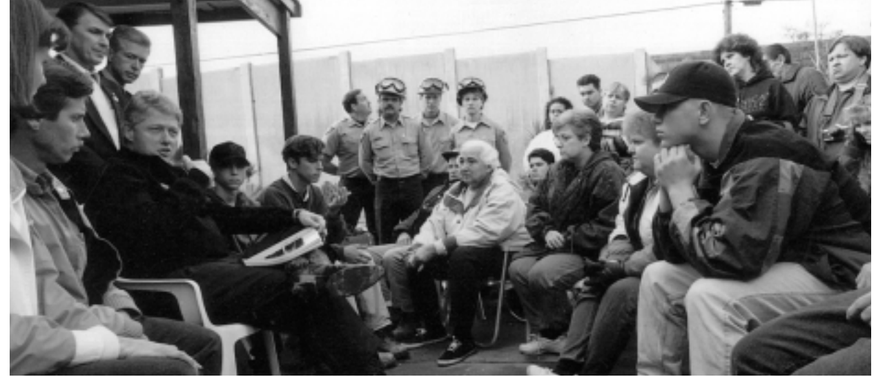
President Clinton talking to California disaster survivors.

the use of palm-pad computers, and centralized processing at two locations.