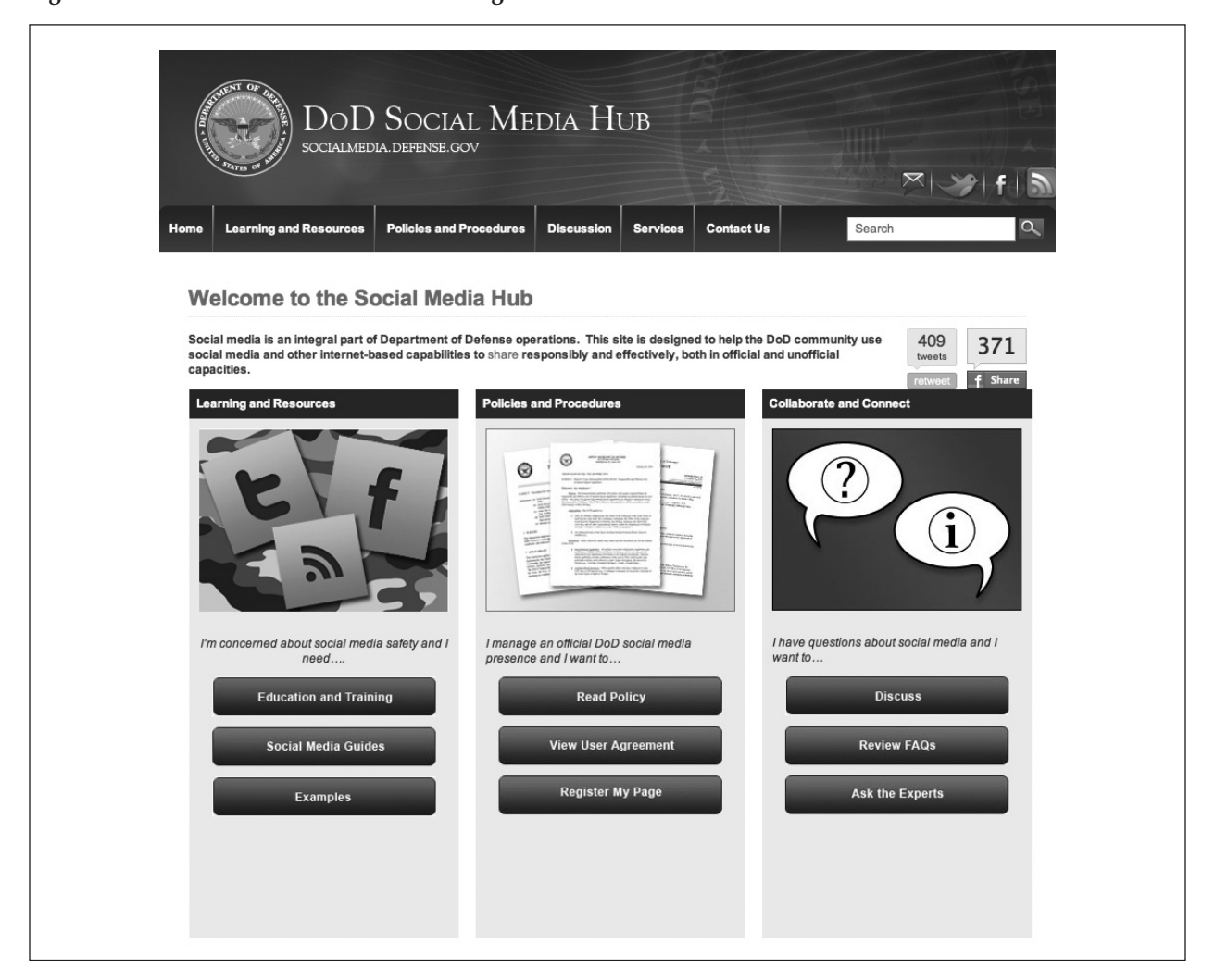
Figure 3. DoD Social Media Hub Home Page

tions about 'social' media and to open some discussions on just what is a 'community.' There is great power in transparency, but also great responsibility. It is now the job of each and every one of us to look out for each other and our communities in whatever forms they take."