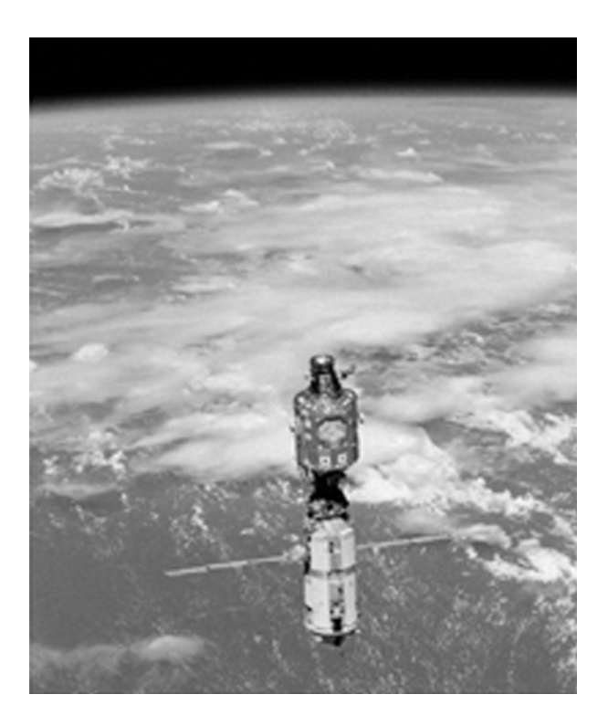
Backdropped against white clouds, the International Space Station moves away from the Space Shuttle Discovery.

partnership. He saw Russia as having technology and experience from which NASA could learn. He even could envision saving money on the Station given Russian cooperation.