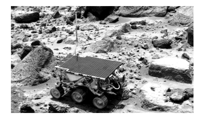
Sojourner, the Mars rover, near the Rock Garden on Mars.

reforms came in 1997 when Pathfinder reached Mars and its tiny Sojourner robot separated to inch along the surface. The mission cost a fraction of the expense of previous Mars probes.