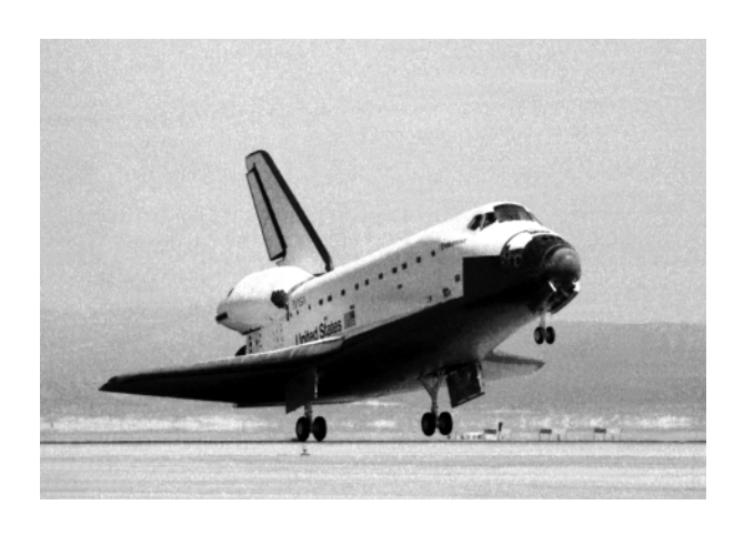
Space Shuttle Endeavour landing at Edwards.

The restructuring strategy had at least four major dimensions: "back to basics," privatizing, decentralizing, and downsizing. While these aspects related to one another, there were differences. "Back to basics" meant focusing on the primary business of NASA, which was research and development (R&D), not operations. The latter was the job of the private sector or other non-R&D agencies. This view led to consideration of what functions NASA could let go and to whom. In February, Goldin commissioned a study that recommended "privatizing" the Shuttle, by which was meant turning over much of the routine work NASA civil servants did to a private contractor.35 Such action was projected to save program money through efficiencies business could introduce. In November, NASA announced it would negotiate a sole-source contract with United Space Alliance, a partnership of the Lockheed Martin and Rockwell corporations specifically formed for Shuttle "operations."36