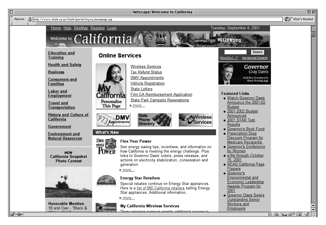
Figure 1: California, http://www.state.ca.us/state/portal/myca_homepage.jsp

California claims the top ranking by successfully creating a customizable, one-stop service shop that gives users the ability to perform a host of tasks, from updating vehicle registration to making campsite reservations, through a uniquely tailored view of the portal features and content.