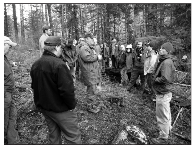
Siuslaw Stewardship Group examining a restoration site.

Yet, despite considerable growth in collaboration among government and nongovernmental partners to achieve mission results, the use of collaboration in many agencies is uneven. Some field units engage in sophisticated collaboratives while others